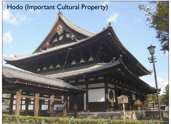
Hodo (Important Cultural Property)

The founder of Higashi (East) and Nishi (West) Honganji is Shinran (1173-1263).