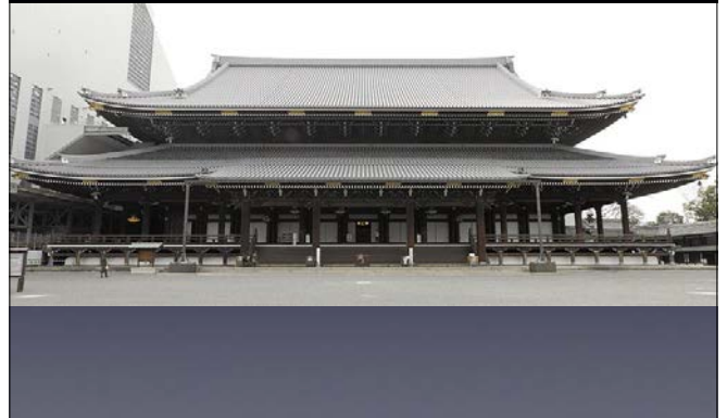
Goeido (main temple)