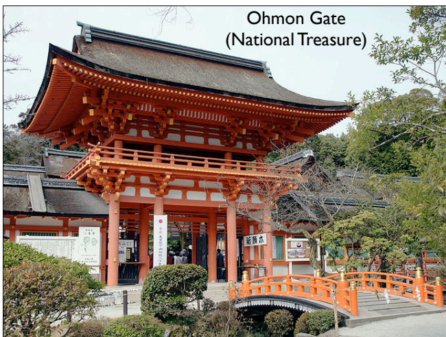
Ohmon Gate (National Treasure)