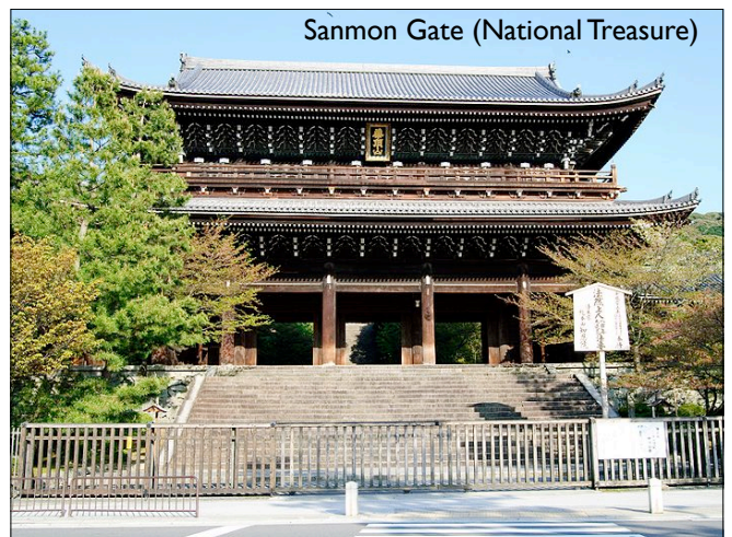
Sanmon Gate (National Treasure)

Founded in 796 Founder : Emperor Kanmu School : Shingon World Heritage Site Kukai was given this temple by the emperor Saga in 823 and he made it a center for Shingon school.