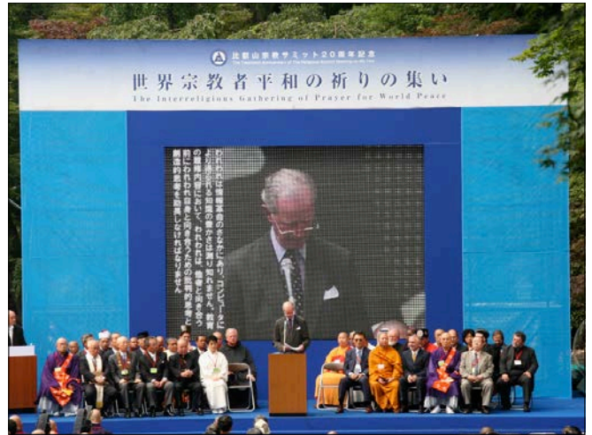
世界宗教者平和の祈りの集い The Interreligious Gathering of Prayer for World Peace