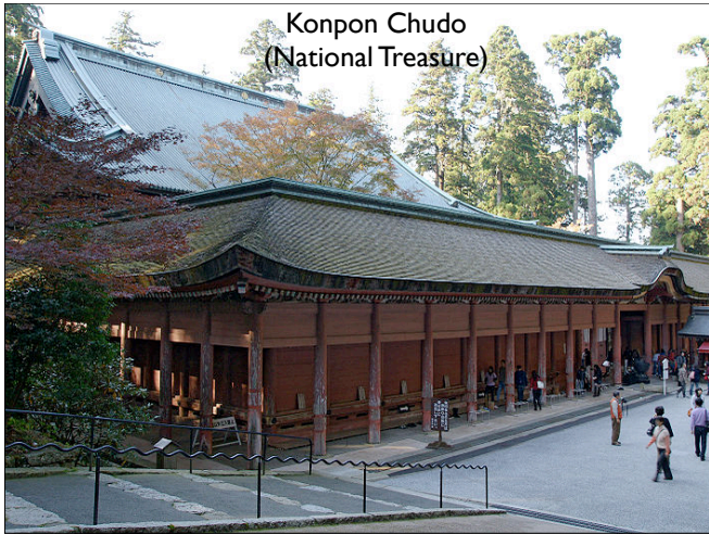
Konpon Chudo (National Treasure)