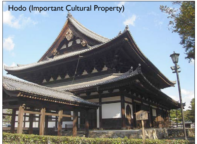
Hodo (Important Cultural Property)

The founder of Higashi (East) and Nishi (West) Honganji is Shinran (1173-1263).