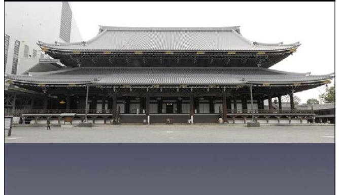
Goeido (main temple)