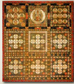
Shingon (Esoteric Buddhism)