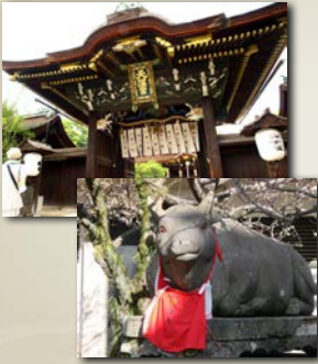
Tenjin (heavenly god) Faith